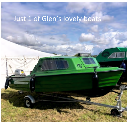
Just 1 of Glen's lovely boats