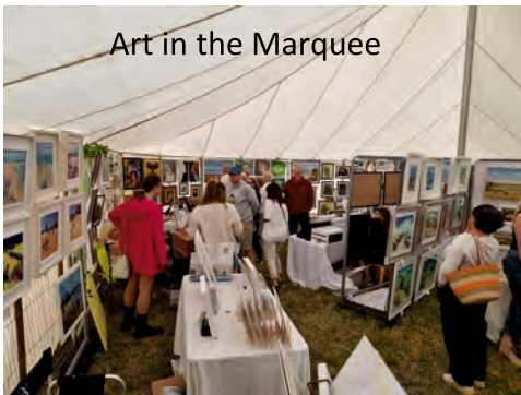
Art in the Marquee