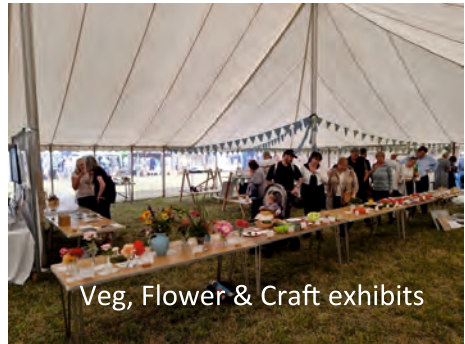
Veg, Flower & Craft exhibits