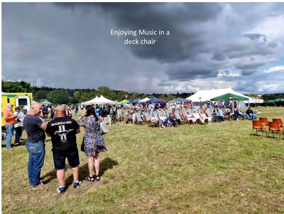
Enjoying Music in a deck chair