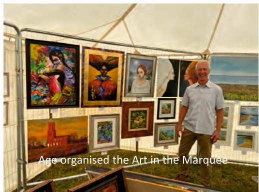
Age organised the Art in the Marquee