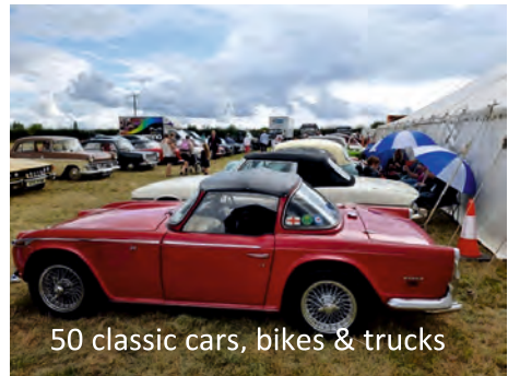
50 classic cars, bikes & trucks