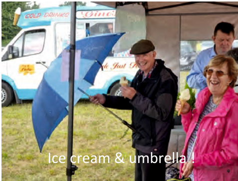
Ice cream & umbrella!