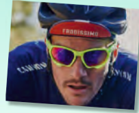
PRIZM™ Technology and high quality Plutonite prescription lenses