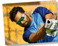
Transitions™ PRIZM™ Field and Gen8™ - lens types to meet your every need

Tel: 01480 499606 info@eyespecsuk.com www.eyespecsuk.com