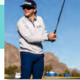
Clearer vision in sunlight with more detail and contrast in all conditions