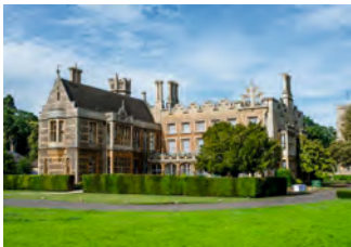
Orton Hall Hotel & Spa, The Village, Peterborough

A life changing event focused on transforming your mindset.